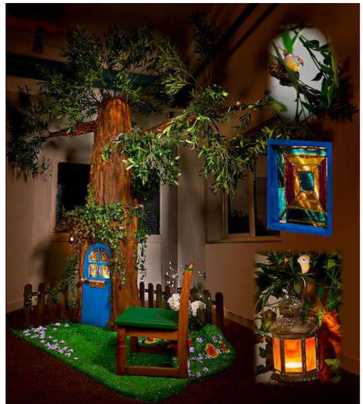
The Hope Tree in CARI's Dublin Therapy Center

'Guiding Our Direction' is the result of a 6- month process that has brought together CARI's Board, management, staff and funders to develop and focus CARI's strategy.